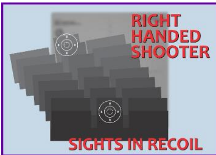
Diagram showing follow through and how the sights move during recoil.

The correct sight picture. Target out of focus and front sight clear and aligned in the rear sight.